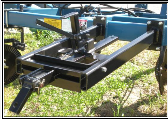
Pull out and swing away wagon hitch