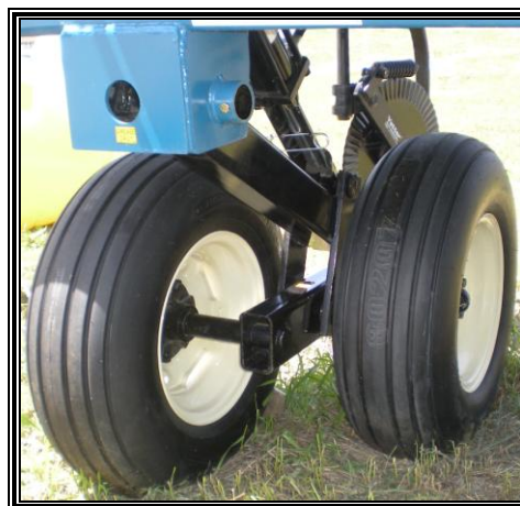
Available with walker axles on lift and gauge wheels, 2” grease-able pivot pins, tapered wheel bearings in walker with grease zerk