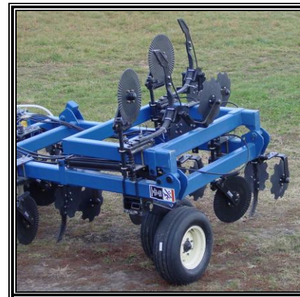
Flat fold outer wing with mechanical lock-down