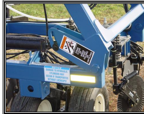
Heavy duty wing hinge with extra long hydraulic pin slot for extra wing travel – 2” grease-able pivot pins