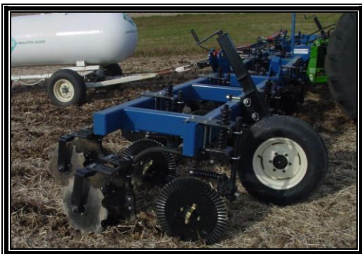
Disc sealers and coupler options