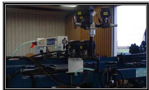
Raven system with multiple shutoffs and ground drive options