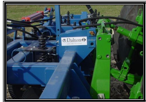
3 point hook-up