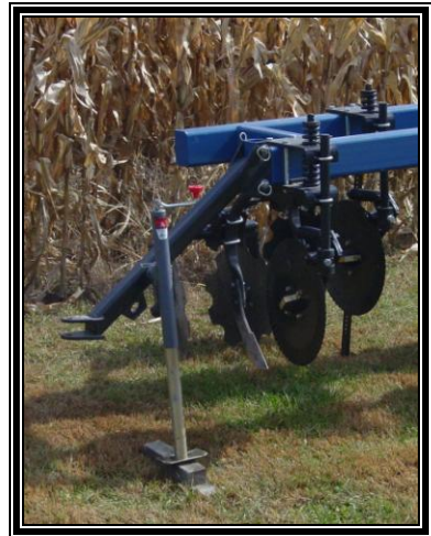
In the inline transport position showing screw type transport wheels, wing lockup with tow tongue attached